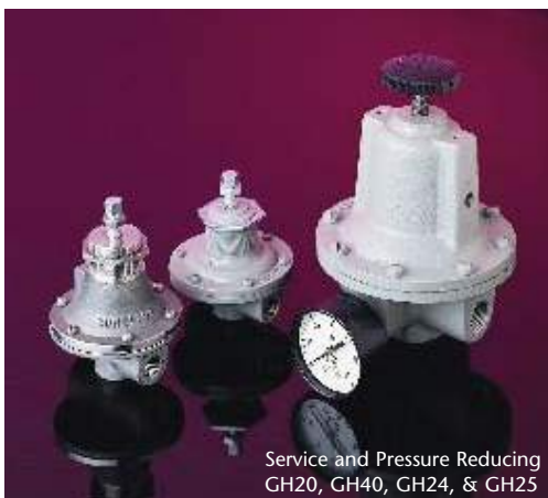
Service and Pressure Reducing GH20, GH40, GH24, & GH25

Note: Please make yourself familiar with the “Terminology” section in front of the catalog and/or product whitepapers available on our web site