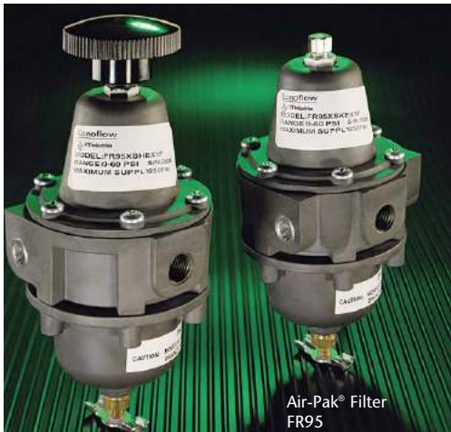
Air-Pak® Filter FR95