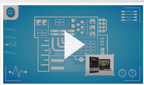
SEE INTELLISENSE® IN ACTION