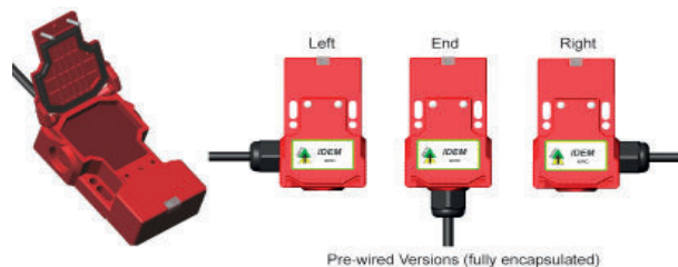
Pre-wired Versions (fully encapsulated)

Standards: ISO14119 EN60947-5-3 EN60204-1 ISO13849-1 EN62061 UL508