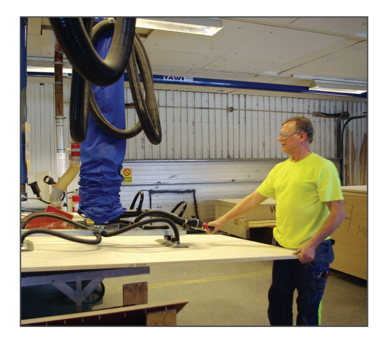
Protect your employees

The VacuMove is a leading manual vacuum lifter that will lift, lower, move and turn most types of goods in all possible environments and working conditions.